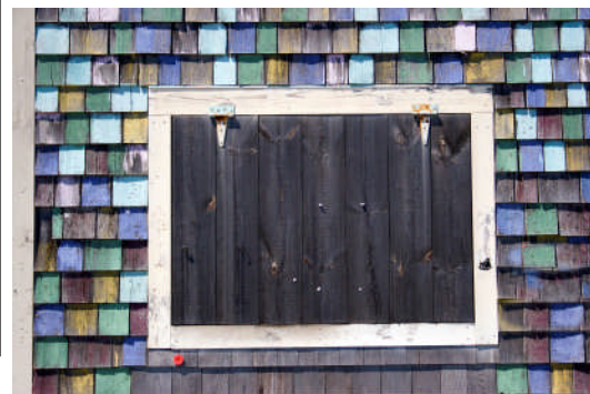
SHINGLE PALETTE GAIL COHEN THIRD PLACE COLOR PRINT CLASS A