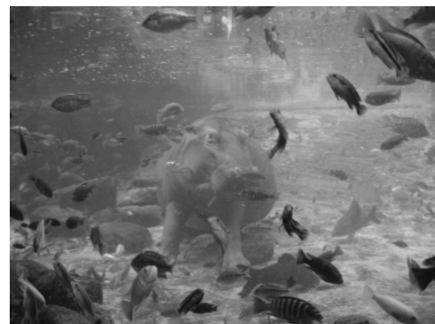
HIPPO TAKING A DIP LISA WILLNOW SECOND PLACE BLACK AND WHITE CLASS B