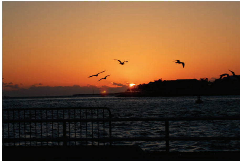
Another spectacular key west sunset.