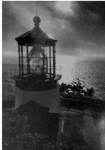
“BEACON OF LIGHT” BY HAL DUPONT FIRST PLACE IN BLACK & WHITE “A”