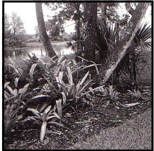
Hackberry Hammock by: Anne Malsbary

So how does the Zone System work? It's a combination of testing your film, your chemicals and your developing times in the darkroom. One problem...many of us do not have darkrooms. So how can you utilize it without doing your own developing. Well, I think I have figured it out. Yes, you do have to test your film. Find a black and white film you like the best. (I don't believe this will work with digital. Sorry... but then, I could be wrong.) I personally use Tri-X 400 ISO film. I set my ISO at half the film's rating so I set my ISO at half the film's rating so I set my light meter at 200 ISO. Years ago Kodak recommended you do that when using their black and white film. Why they didn't rate it at 200 to begin with was a question I never got answered. I then point my 1 degree meter at the darkest