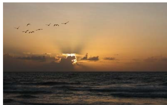
1st Place Color Print Class A at Feb. Meeting