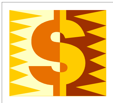
For Sale or Swap available at each meeting

Please come early to the meeting to arrange your items.